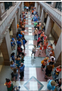
Right: Just a fraction of the tremendous line waiting to testify at the Senate hearing for HB2 on July 8.