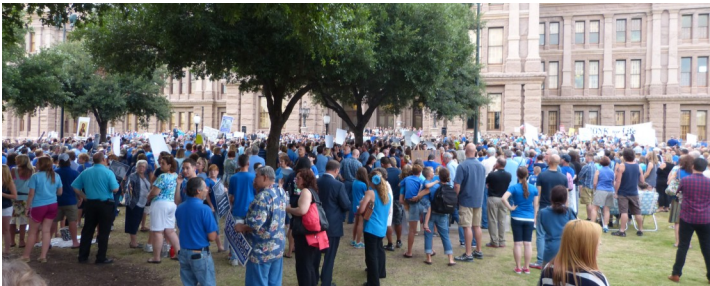
There was a pro-life rally that same day - keynotes Mike Huckabee & Michelle Duggar drew quite a crowd!