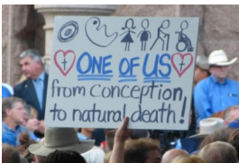
My favorite sign from the rally. We had a few groups of orange-wearing abortion advocates, but DPS kept things running smoothly.

July 9: House debate on HB2. Rep. Senfronia Thompson handed out wire coat hangers and wielded knitting needles to illustrate her claim that the bill would send women to back alley abortionists. Drama, drama...but not a drop of logic in sight.