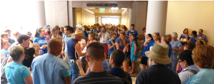
The singing, joyful pro-life crowd waiting for the House hearing on HB2 to begin, July 2

As far as what I saw there - for that, I’ll share some pictures. I hear they’re worth more than many words, anyway. :)