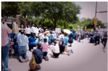
One of the high points of my week: the Eucharistic procession from St. Mary Cathedral to the Capitol. Dozens of people kneeling on searing concrete in the midday sun.

Senators Dan Patrick & Donna Campbell supporting Senator Glenn Hegar as he carried the bill through the Senate floor debate, July 12. Great pro-life heroes!