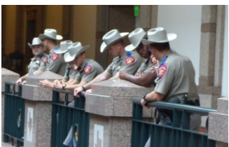
Some of the amazing DPS officers who kept everybody safe. They did a fantastic job, stayed cheerful and were fair with all. Can’t say enough good things about them!