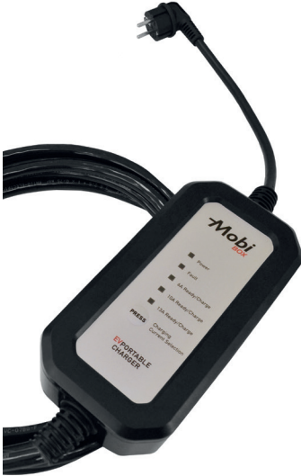
Mobi Box front panel Schuko version