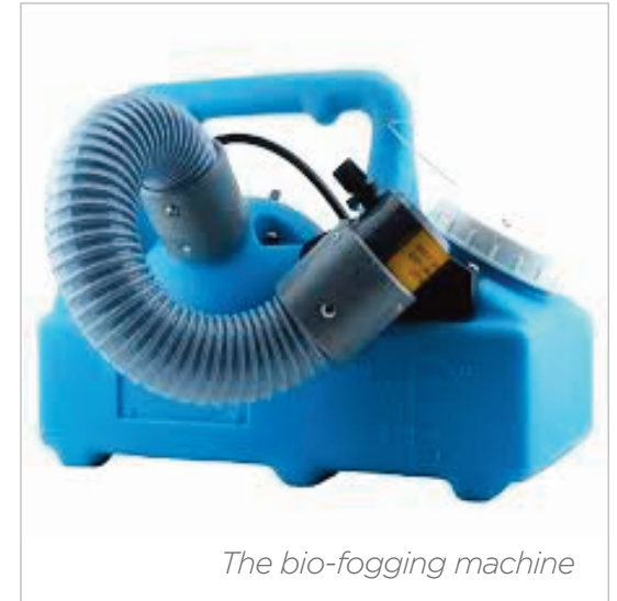
The bio-fogging machine

The active ingredient in the fogging solution is stabilised Chlorine Dioxide which is effective against a broad spectrum of pathogens.