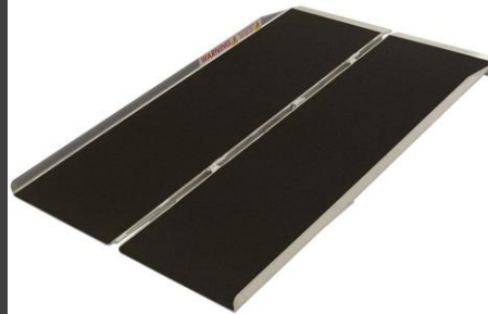
ADA Curb Ramp