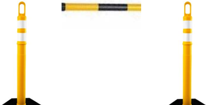
Bollards and Poles