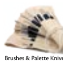
Brushes & Palette Knives