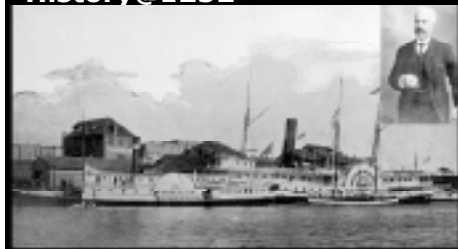
The S.S. Amelia and S.S. Olympian dock at the rear port of the 1252 Wharf Street lot (pictured to the left), ca. 1900.

April 1, 1902, 1252 Wharf Street, then 90 Wharf Street, became the home of Turner, Beeton & Company, Ltd. Turner & Beeton specialized in the sale of wholesale goods, liquors and cigars, the import and canning of salmon, and the manufacturing of textiles. One of its illustrious owners, John H. Turner (pictured above), also served as BC Finance Minister, BC Premier, and the provincial ambassador in London.