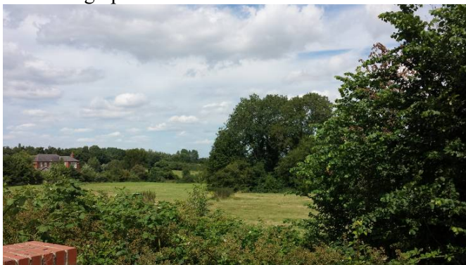
View looking north from Woodgate Road towards wet woodland around field pond.