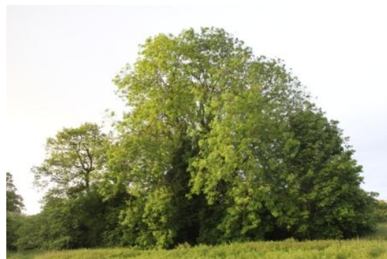
View from the Coppice.