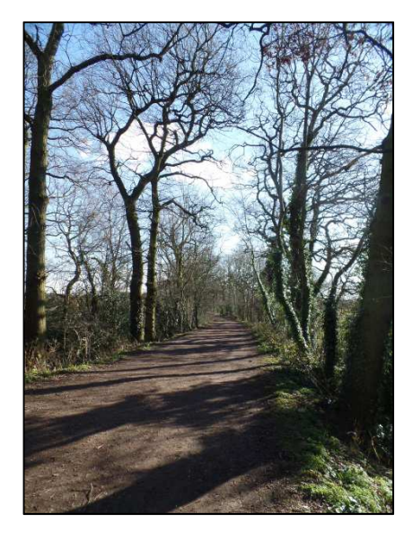
Table 13.1 Site overview

13.1 The Parish of Groby consists of Groby, Bradgate Hill and Field Head. Groby is identified as a key rural centre within the Hinckley and Bosworth Core Strategy. It has a population of 7389 and an area of 867 hectares (Census 2011). There are 29 open spaces listed in the table below which have been assessed. Groby is within the National Forest and there are a number of wooded areas within the parish which is evident from the number of natural and semi-natural open spaces identified through the study. A map of the open spaces around the village is included in Appendix 1. For those sites which fall outside the settlement these can be viewed on the Borough Wide Map.