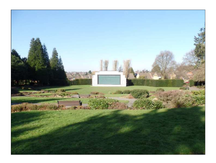
Table 15.1 Site overview

15.1 The urban area of Hinckley is made up of four wards which includes: Hinckley DeMonfort, Hinckley Clarendon, Hinckley Trinity and Hinckley Castle. It has a population of 30,681 and an area of 1,528 hectares (Census 2011). There are 75 open spaces listed in the table below which have been assessed the largest park is Clarendon Park (HIN55) which has a number of different open space typologies on site.