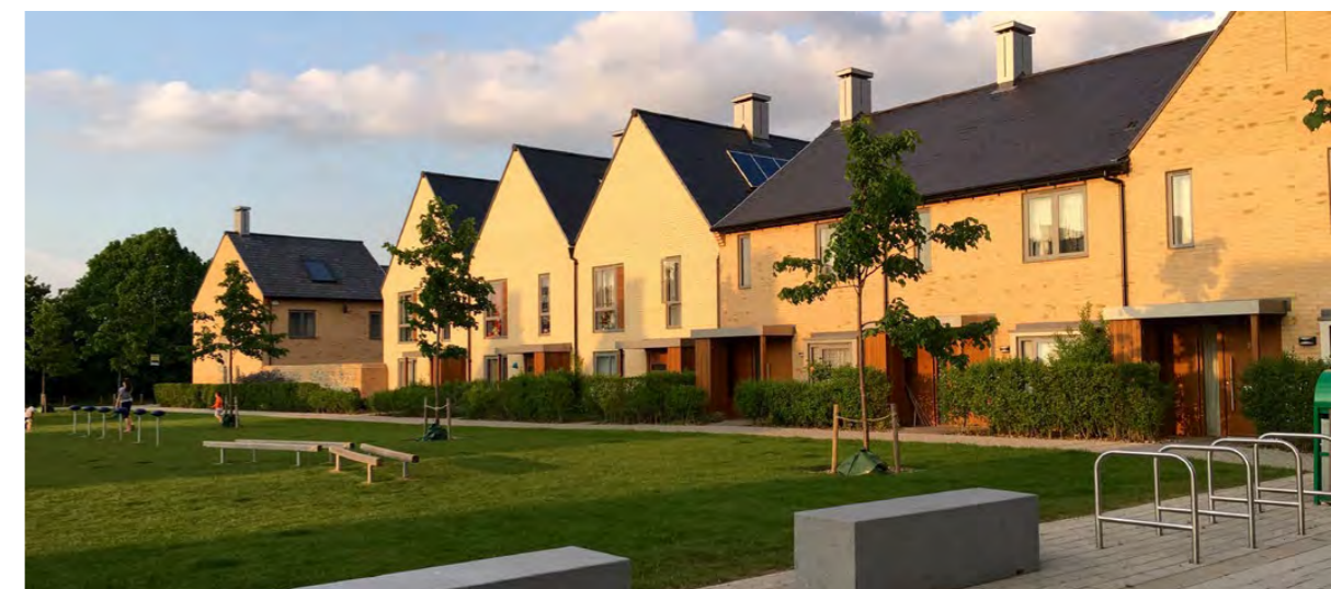
Trumpington Meadows, Cambridge, Barratt Homes

The next stage is to upload details of the development onto www.builtforlifelifehomes.org . The scheme will then be subject to a 'light touch' review. If the development will have a strong likelihood of achieving a quality mark, the applicant will be invited to attend a Built for Life™ panel presentation where the scheme will be considered in more depth.