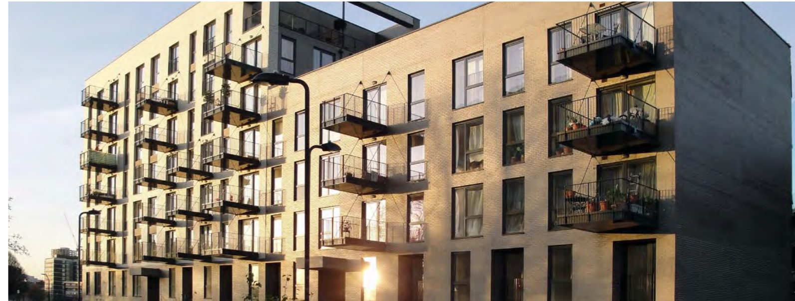
Bridport House, Hackney, London Borough of Hackney

Celebrating and recognising quality. Ensure that developers that secure Built for Life™ accreditation are recognised. A 'well done' press release and photo shoot with a developer and a local politician can help raise positive interest in a new development when sales activity begins. This in turn can help raise wider public and industry interest and demand for Built for Life™ accredited schemes.