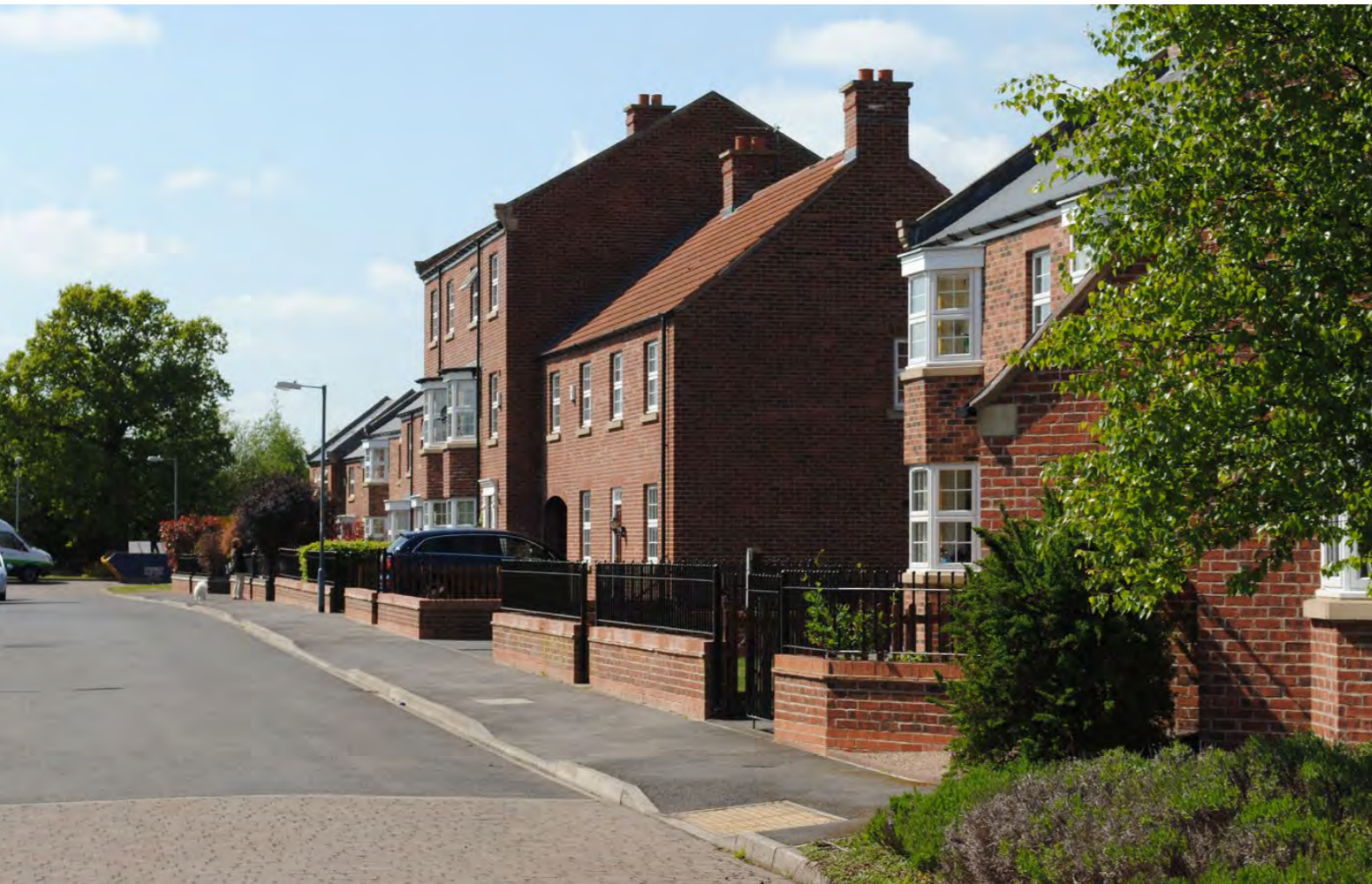
A straight building line reinforces clear distinction between public and private spaces, The Strike, Helmsley, Taylor Wimpey