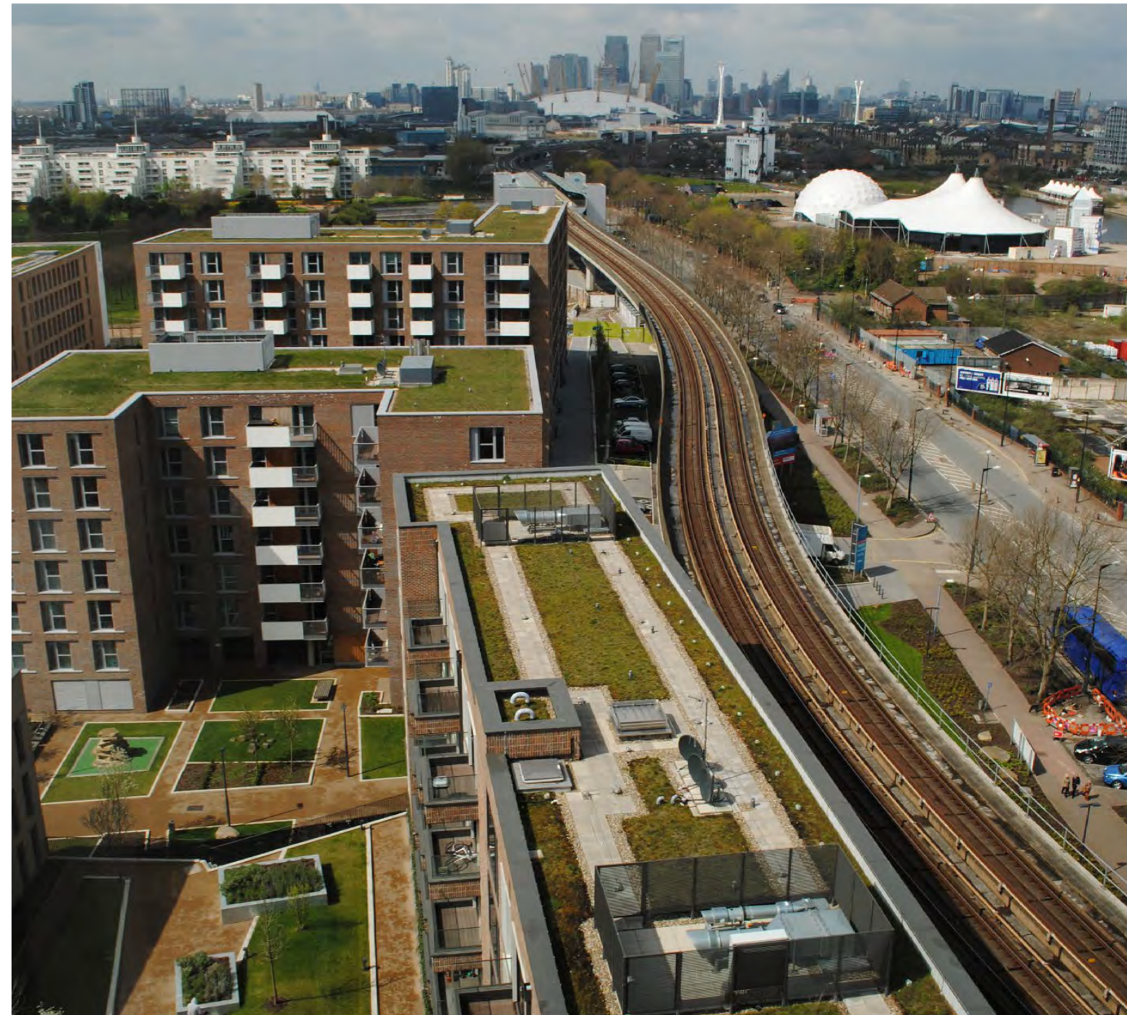
Development with easy access to Docklands Light Railway, Waterside Park, London Docklands, Barratt London

Thinking about development sites in isolation from their surroundings. For example, bus only routes (or bus plugs) can be used to connect a new development to an existing development and create a more viable bus service without creating a 'rat run' for cars.