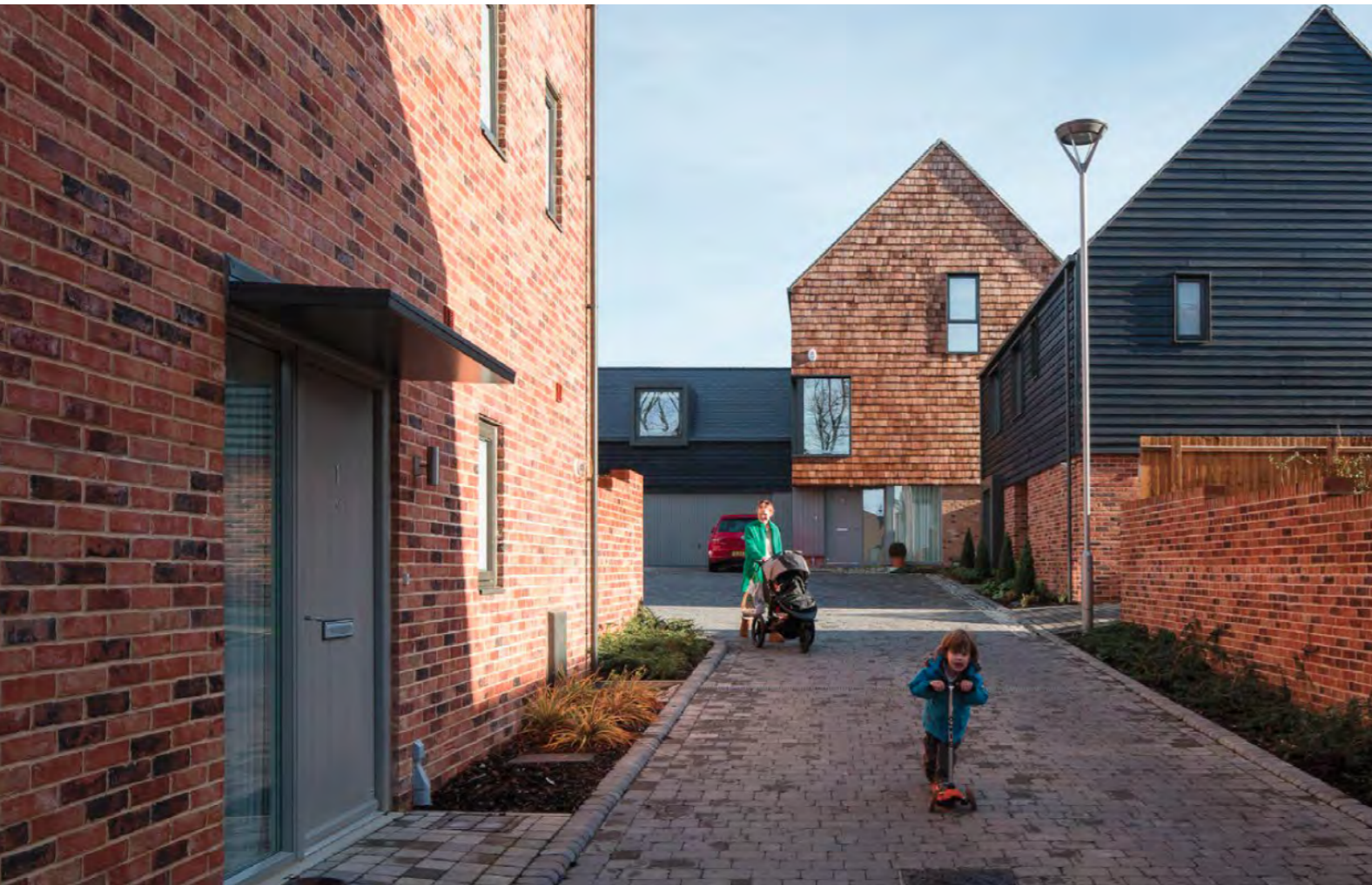
High quality hard landscaping, The Avenue, Saffron Walden, Hill

9b Are streets designed in a way that they can be used as social spaces, such as places for children to play safely or for neighbours to converse?