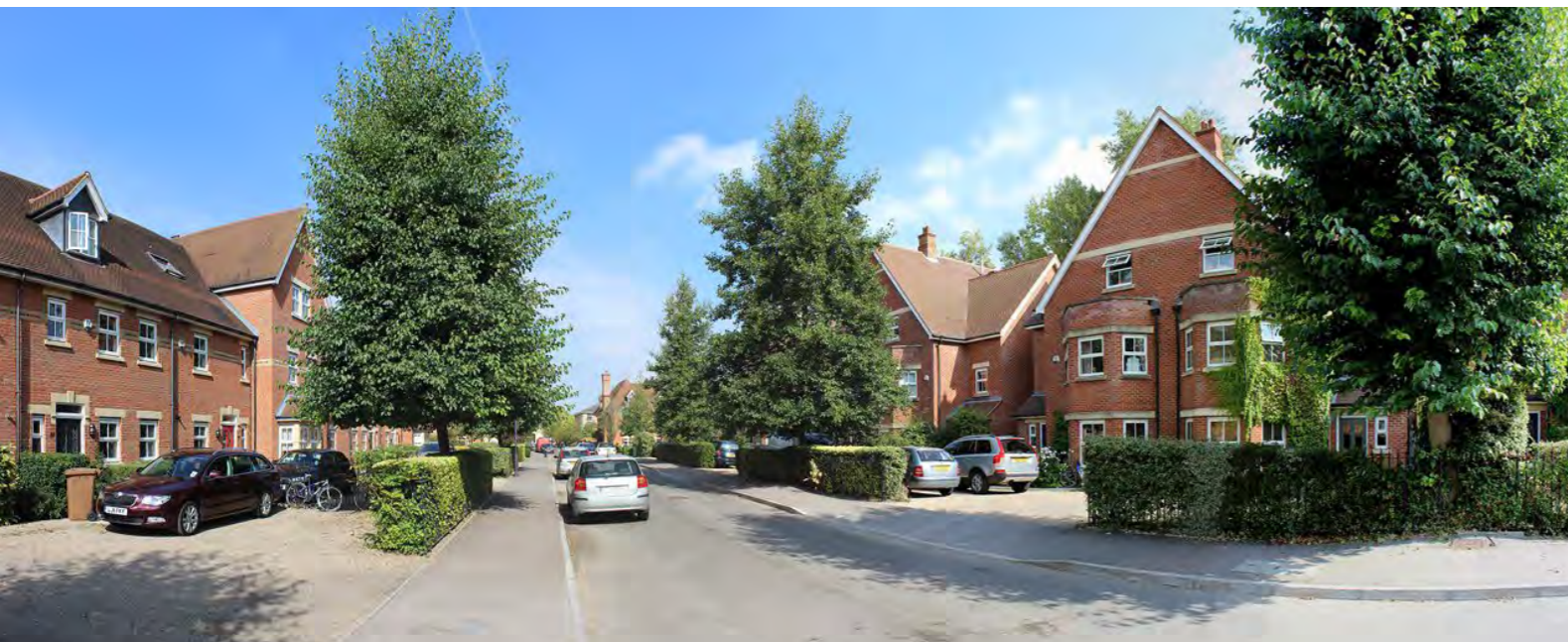
Oxford Waterside, Jericho, Berkeley Group

BfL12's questions were created to help designers and non-designers to work better together and create better places. BfL12 is primarily a discussion tool – a framework around which issues and ideas can be explored. BfL12 therefore works best if used at the start of the planning process. BfL12 is not designed to be used in isolation as an assessment tool once a planning application has been submitted. If BfL12 has not been used throughout the planning process we do not support its use as a justification for the refusal of a planning application. Likewise, if BfL12 has not been used by a developer at the inception stages of a proposed development and throughout the pre-application process, it should not be used to support an application.