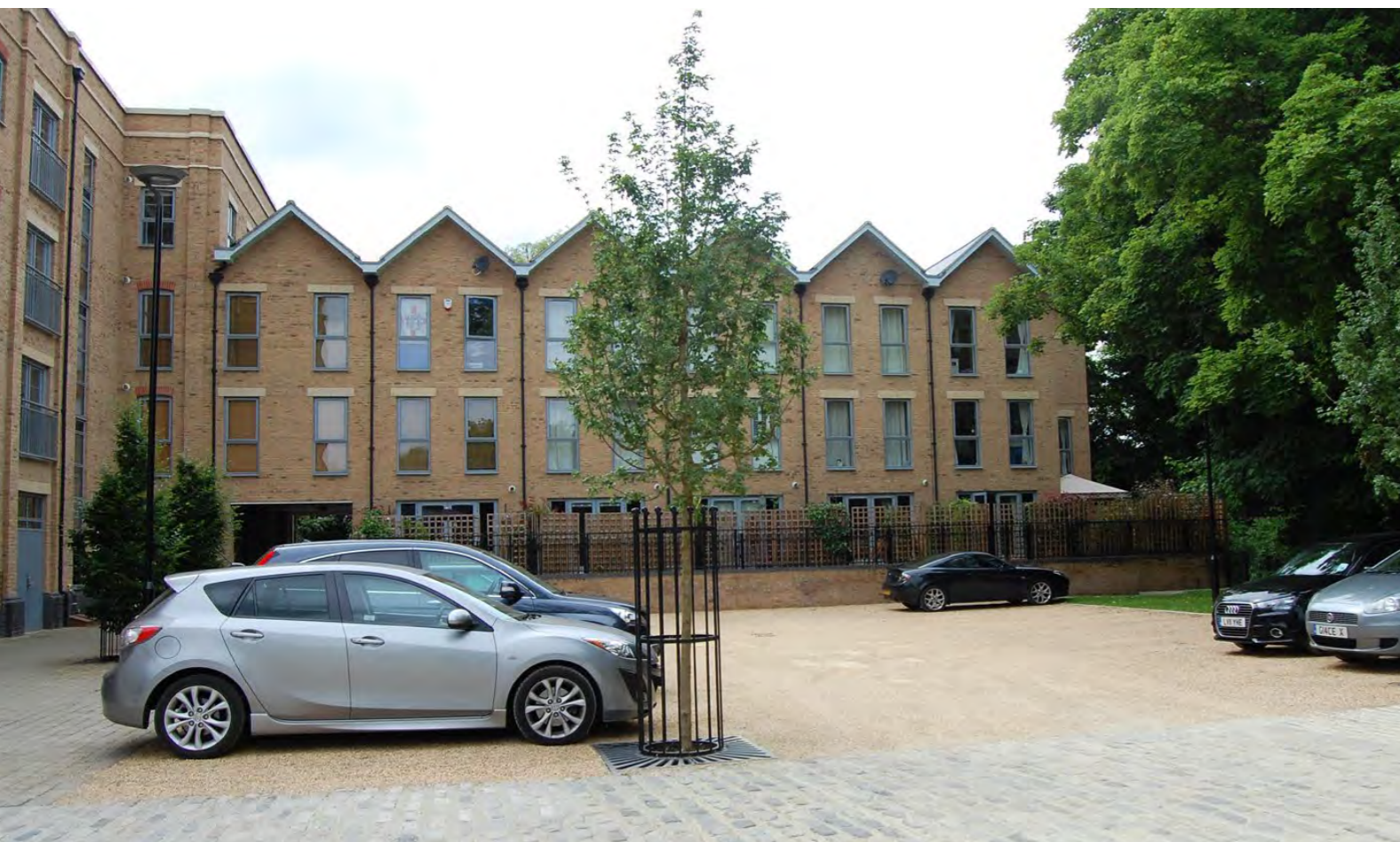
Unallocated bays in small shared courts efficiently deal with varied parking demands, The Mill, Horton Kirby, Fairview Homes