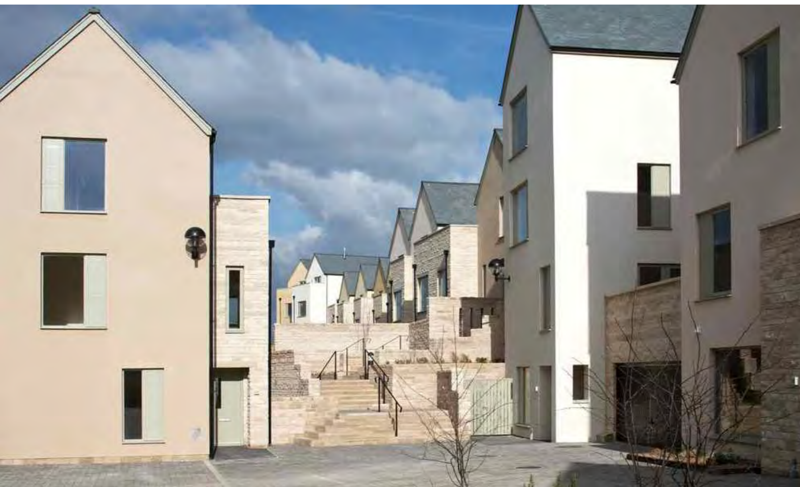
Hard landscaping is responsive to the different levels on site, Osprey Quay, Weymouth, Zero C Developments

6c Should the development keep any existing building(s) on the site? If so, how could they be used?