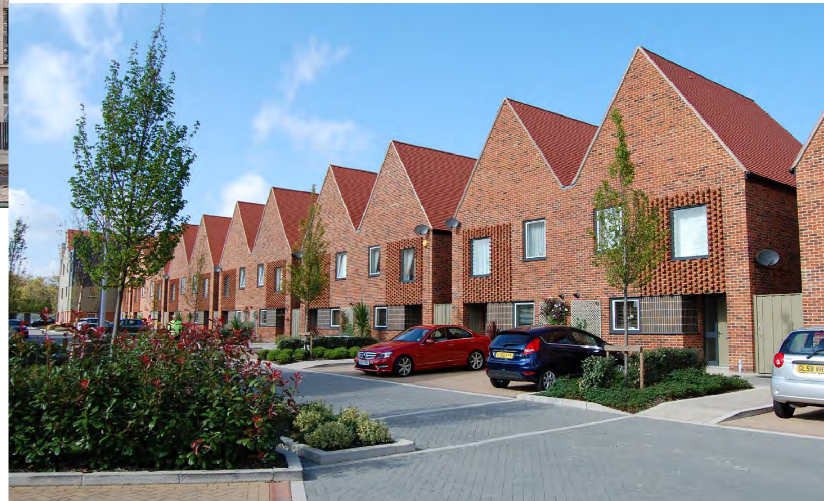
Horsted Park, Chatham, Countryside Properties

A key benefit of BfL12 is that it can help local planning authorities consider the quality of both proposed and completed developments. The jargon free language of BfL12 will help planning officers to better communicate design considerations to Elected Members. BfL12 is also useful for creating site-specific briefs, structuring Design Codes and local design policies.