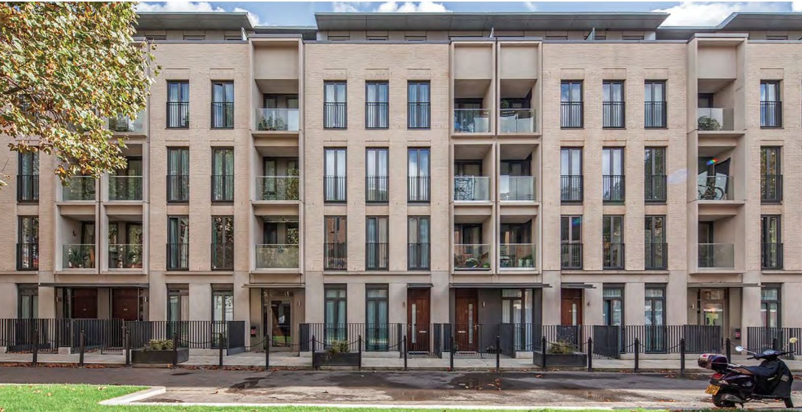
Portobello Square, RB Kensington & Chelsea, Catalyst

An increasing number of home builders are using BfL12 as a way of working to help speed up the planning process and improve the quality of the places they build. Ten years in the making, piloted on live planning applications and written to fit alongside both the National Planning Policy Framework and National Planning Practice Guidance, BfL12 has become the home building industry's preferred way of creating well-designed new homes and communities.