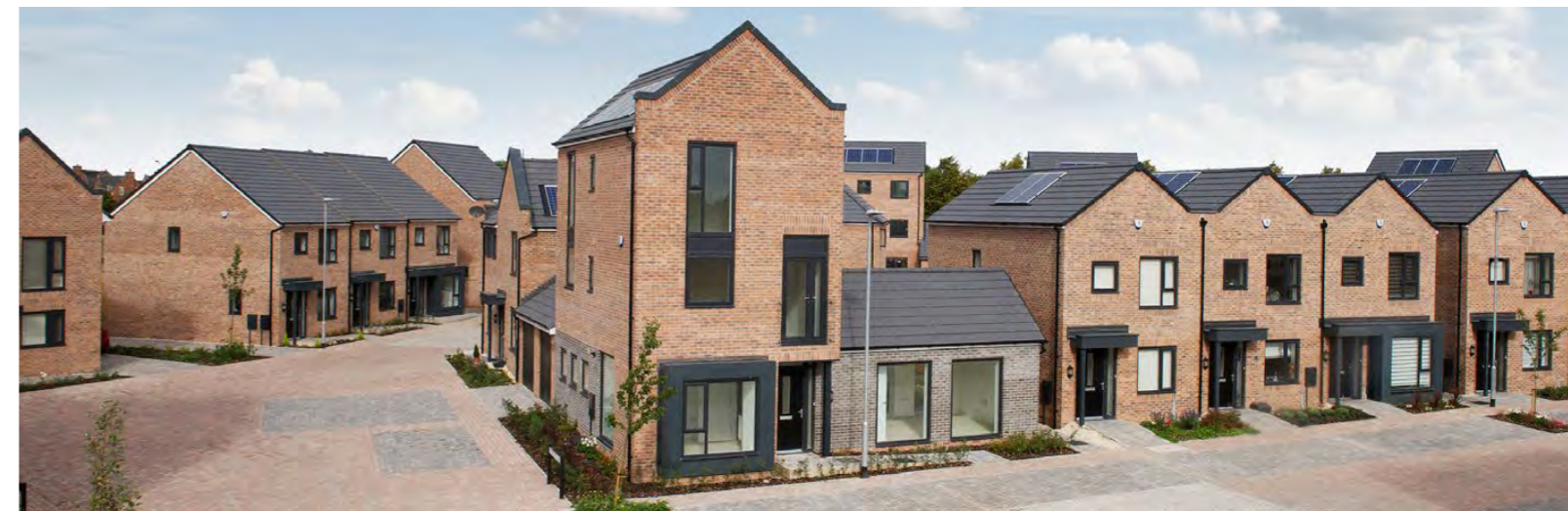
Cottam Meadow, Preston, Barratt Homes

If a scheme is considered a potential candidate for Built for Life™ accreditation there will be independent scrutiny of developments once an application has secured planning approval. Through this independent review process, home buyers can have the confidence that Built for Life™ accreditation is the sign of a good place to live.