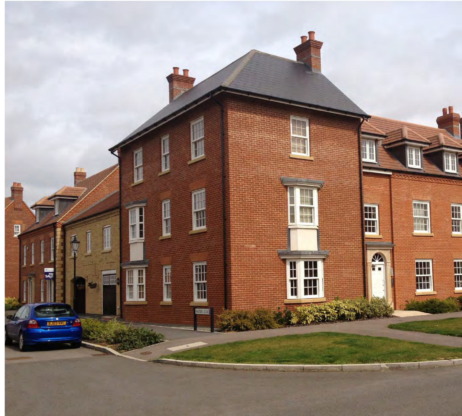
Apartment blocks at corner give streets definition and helps way finding, Bedford Park, Bedford, Barratt Homes

Layouts that separate homes and facilities from the car , unless the scheme incorporates secure underground car parking.