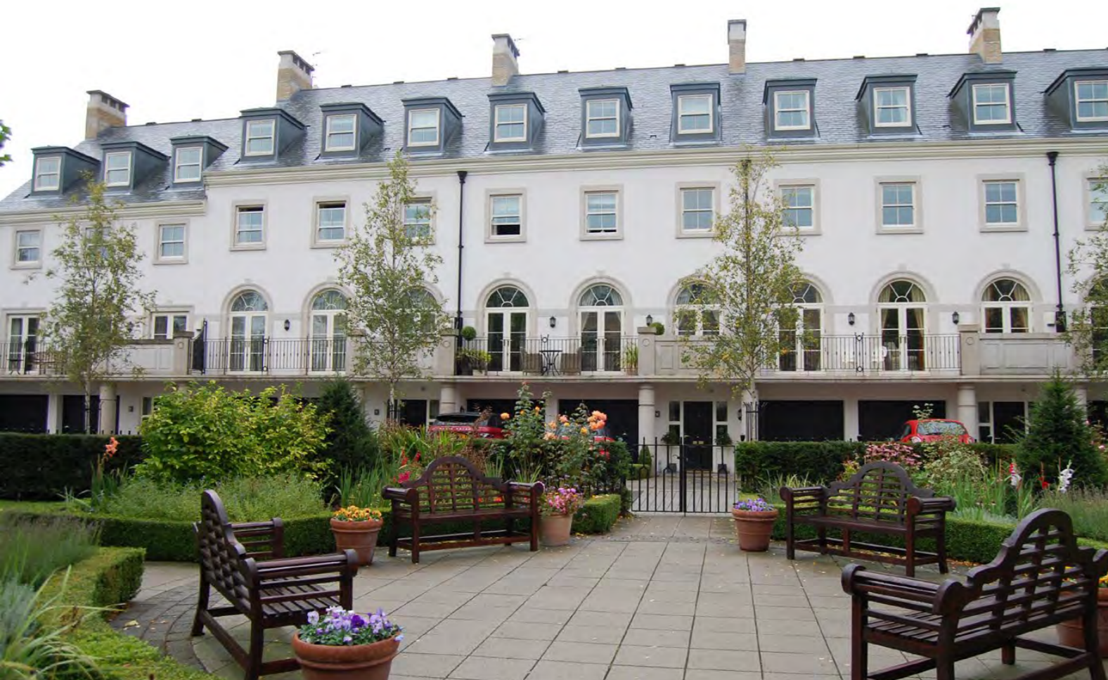
Shared garden, The Square, York, Nixon Homes