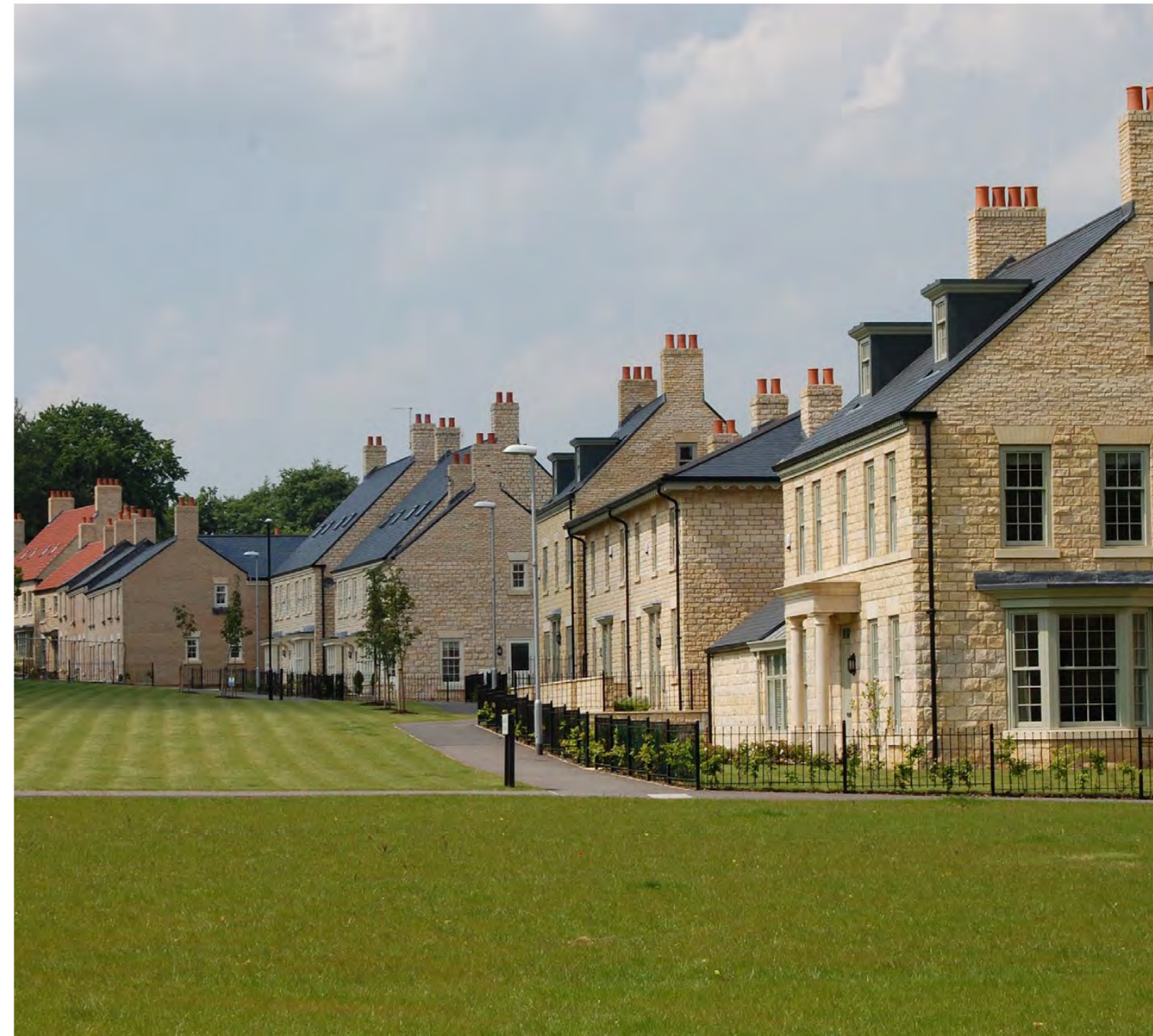
Simple, direct and overlooked footpaths encourage walking, Church Fields, Boston Spa, Taylor Wimpey

Not considering where future connections might need to be made - or could be provided - in the future.