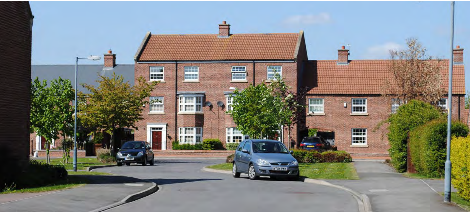
The Strike, Helmsley, Taylor Wimpey

BfL12 is a way of working that helps guide development proposals towards better design. Developments that are based on these principles will help developers demonstrate to local planning authorities that their proposals are well considered and responsive to considerations such as local characteristics specific to a given site.