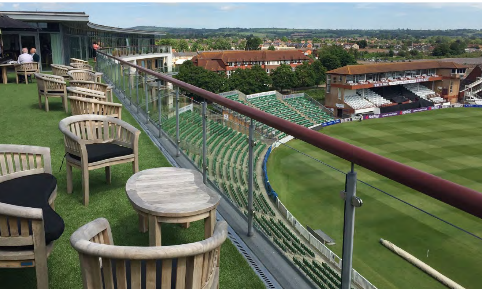
This housing for seniors incorporates a wonderful social space, Pegasus Court, Taunton, Pegasus Life

2d Does the layout encourage walking, cycling or using public transport to reach them?