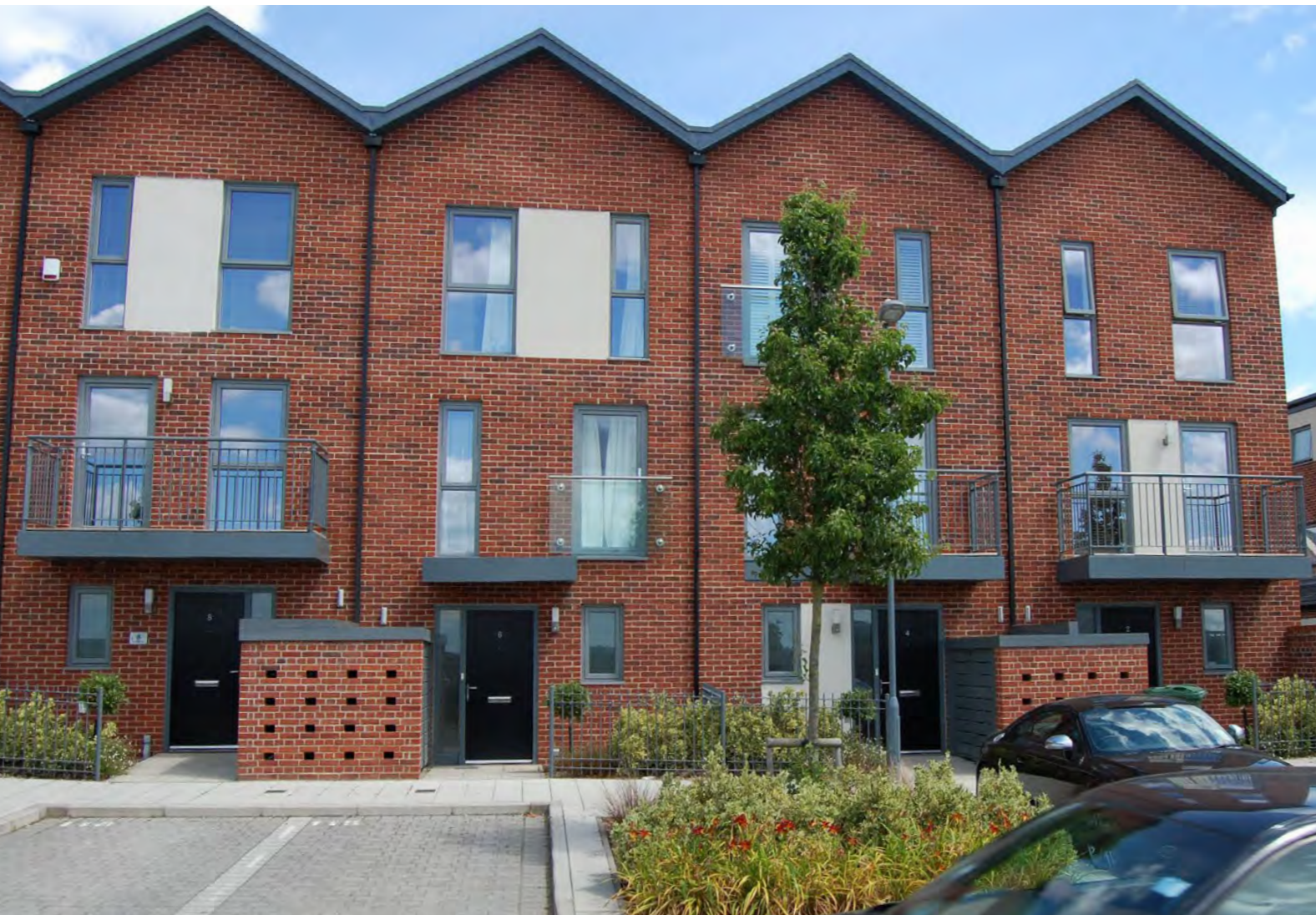
Robust brick bin stores, Centenary Quay, Southampton, Crest Nicholson

12b Is access to cycle and other vehicle storage convenient and secure?