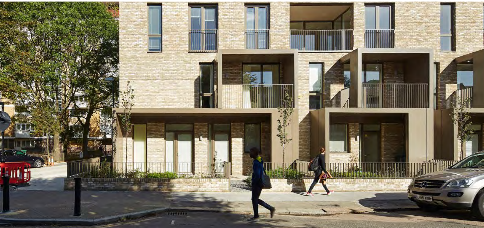
Ely Court, South Kilburn, Catalyst and London Borough of Brent

Previous versions of Building for Life have relied on Accredited Assessors to provide definitive assessments of proposed developments, however this process has now changed. BfL12 places an emphasis on design focused discussions. At the start of the planning process, all those involved including local communities and other stakeholders are encouraged to contribute towards a discussion about what a place should become and what it needs to do. Particular stakeholders might have specific concerns or interests that can be captured in one or more of BfL12's questions.