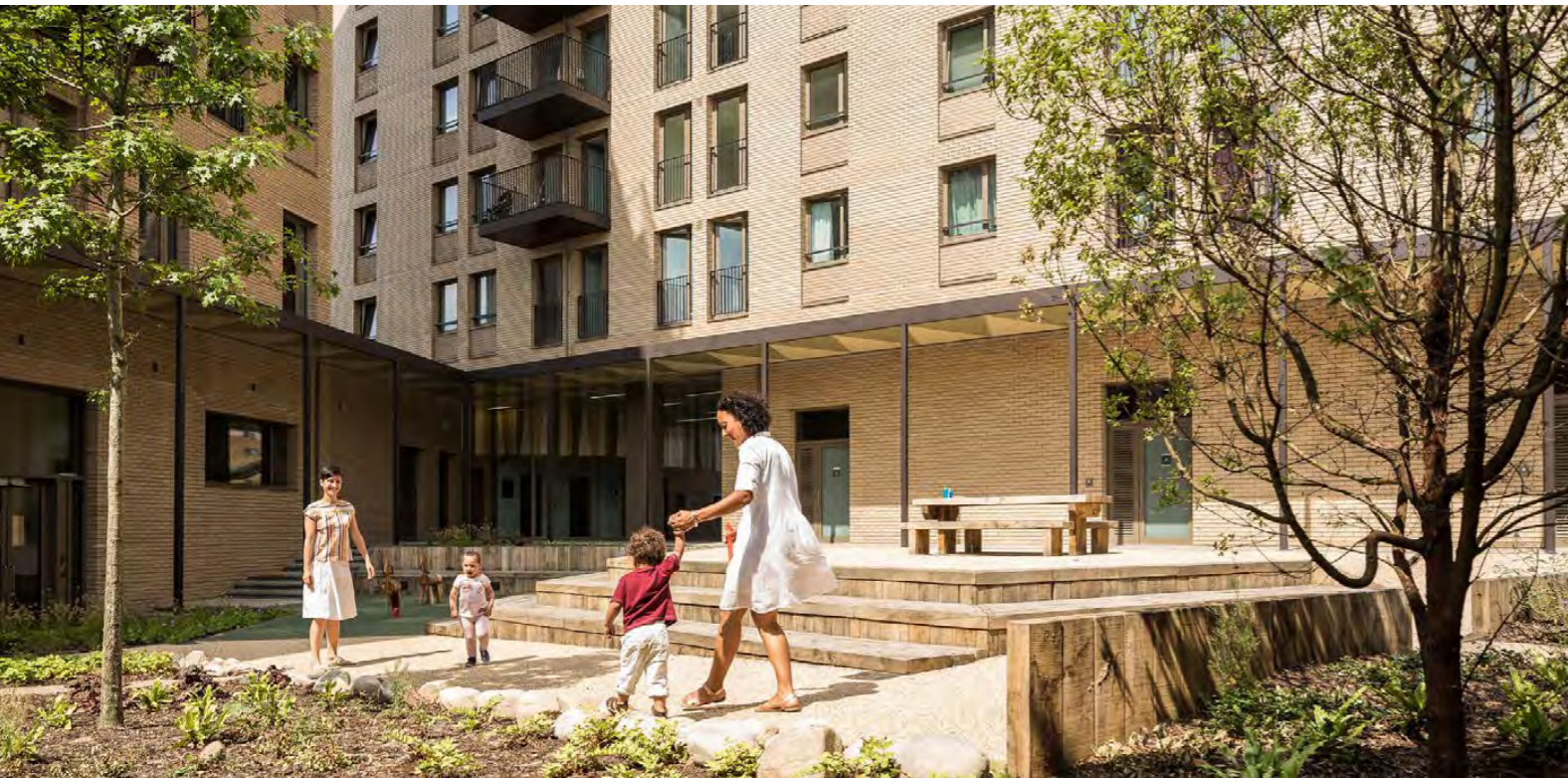
Roseberry Mansions, Kings Cross, One Housing

As outlined before, Building for Life's 12 questions are grouped in three distinct sections: