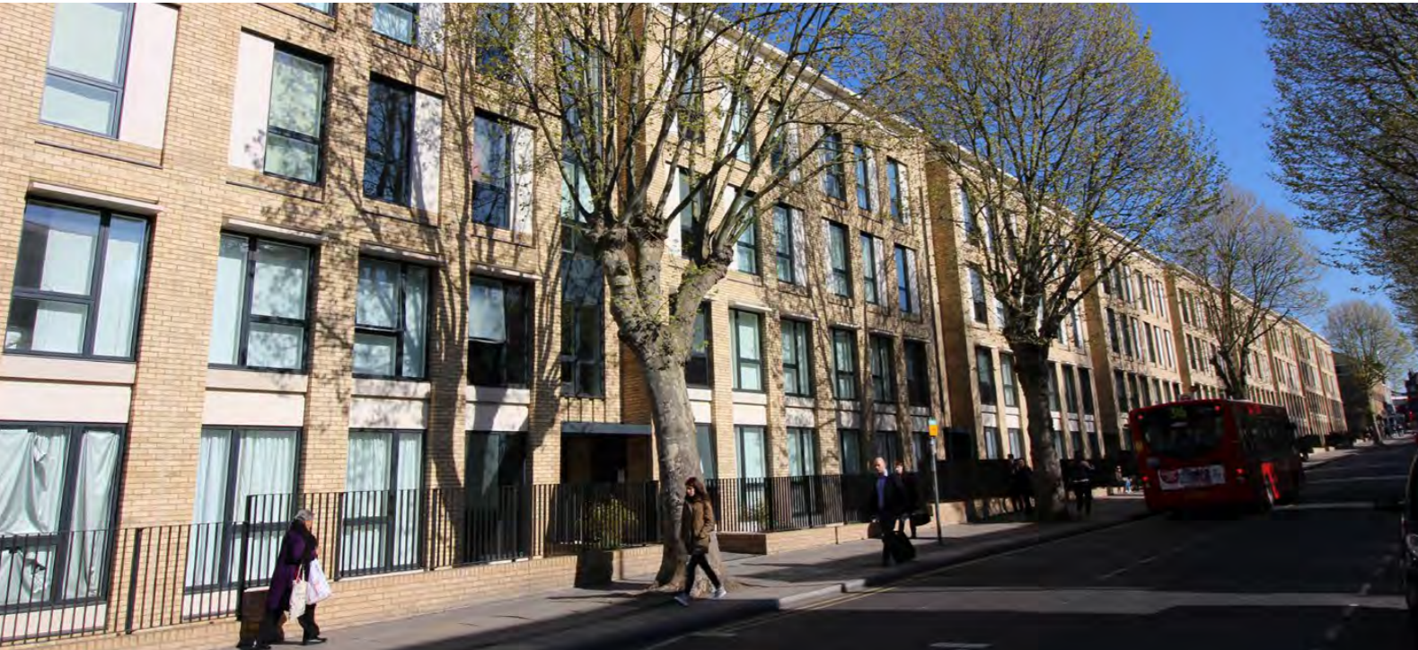
Kilburn Park, South Kilburn, Catalyst and London Borough of Brent

BfL12 is effective where local authorities use it as a way of working, framing pre-application discussions relating to design and support decision-making against the twelve questions. Yet, BfL12 is at its most effective where it is used as a 'golden strand'. The 'golden strand' comprises of a series of elements. Local authorities are encouraged to work towards putting each of these elements in place. In some situations, we recognise it might be difficult or impossible to embed or achieve each of these elements for a variety of local reasons. The more elements that are in place the better and more effective BfL12 can be in your local area.