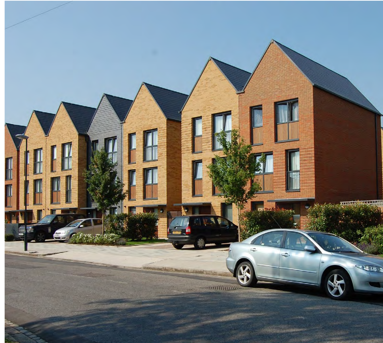
Mixed tenure houses, Kidbrooke Village, RB Greenwich, Berkeley Homes

Reducing the level of parking provision for rented/shared ownership homes.