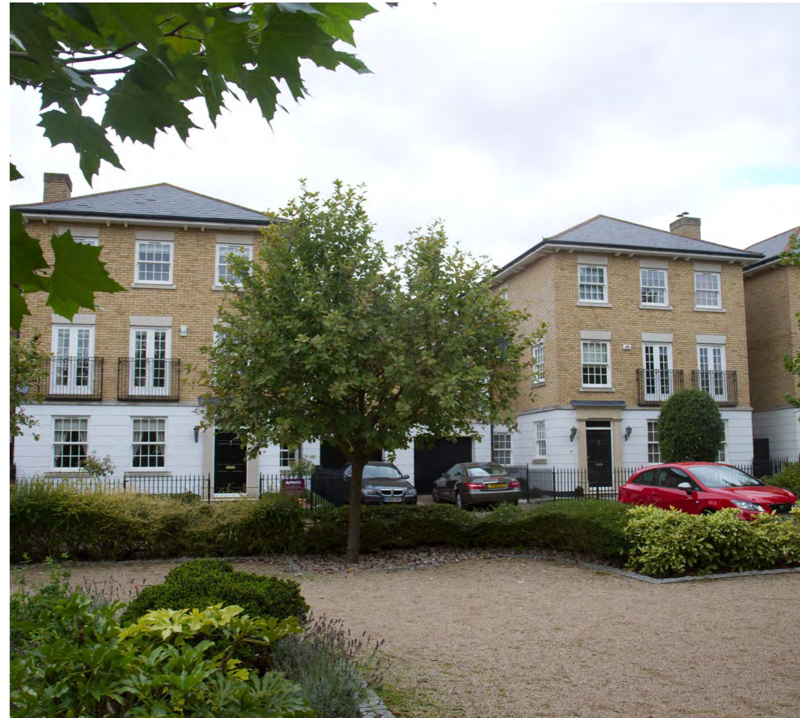
The landscaping of this housing square mirrors the town housing type, Thorley Lane, Bishops Stortford, Countryside Properties

Using the lack of local character as a justification for further nondescript or placeless development. Ignoring local traditions or character without robust justification.