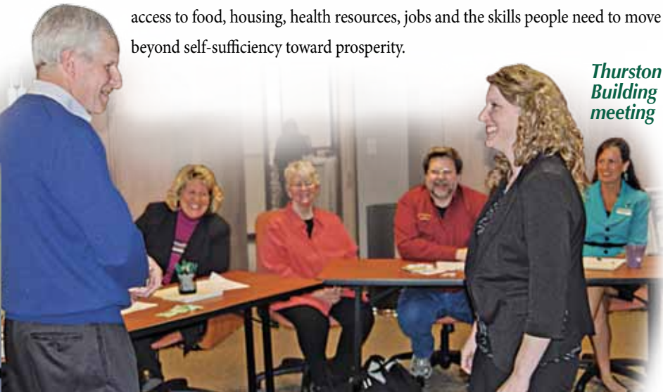
Thurston Asset Building Coalition meeting

The coalition's ongoing work focuses on the constellation of issues people face to escape poverty's grip. It is imperative that the network of providers ensure that their services improve access to food, housing, health resources, jobs and the skills people need to move beyond self-sufficiency toward prosperity.