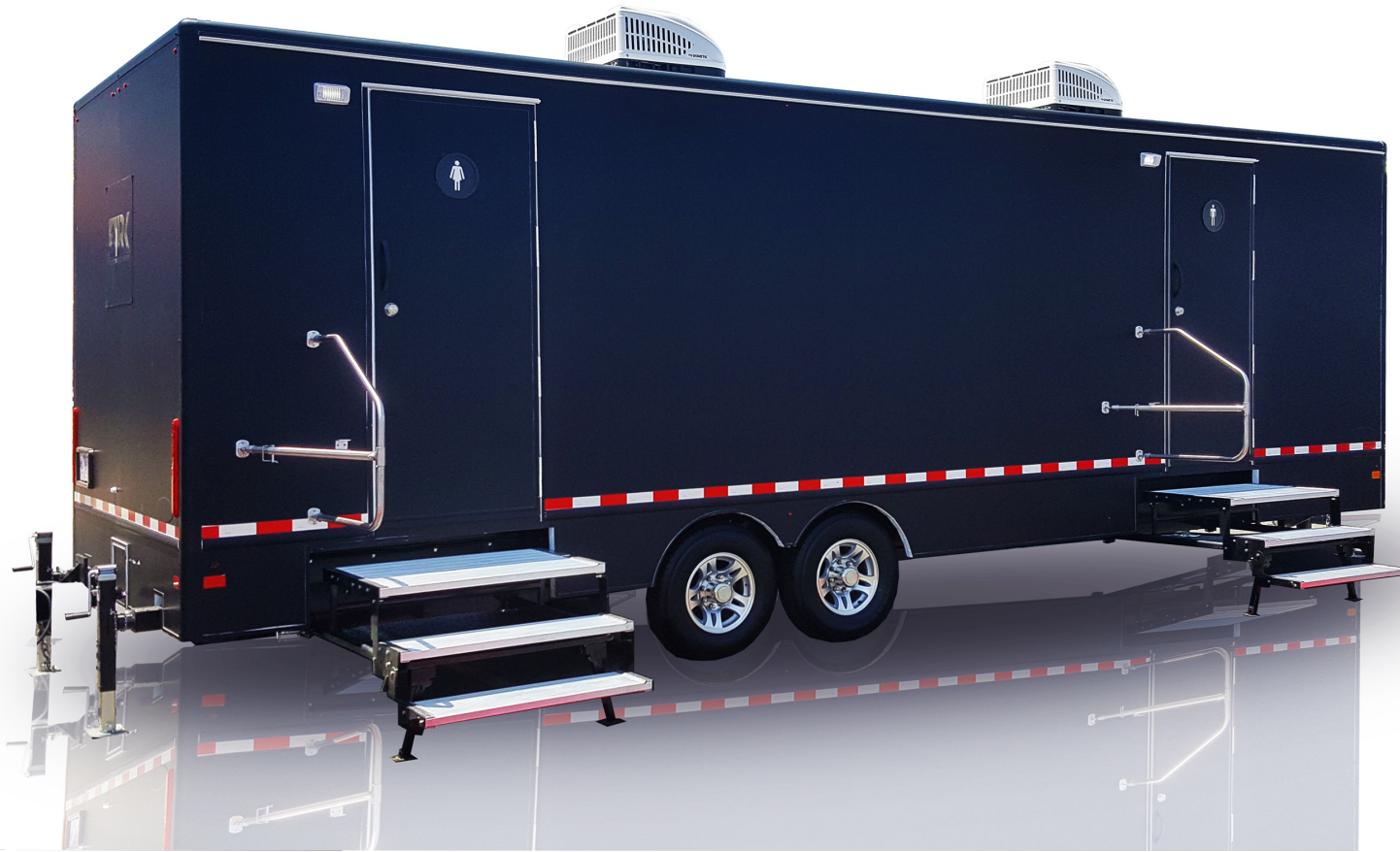
28' model shown